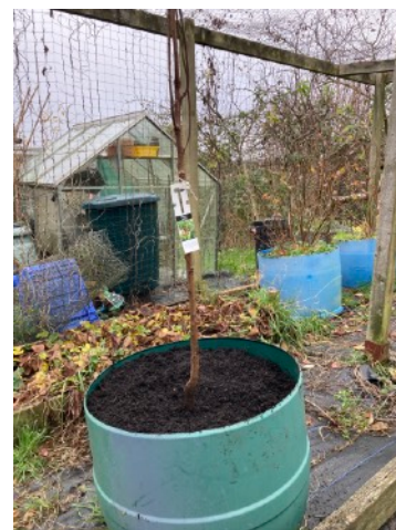
One dwarf apricot tree ready for planting - well almost !