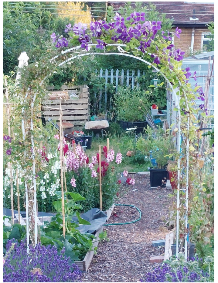
Beautification of Sunnyside