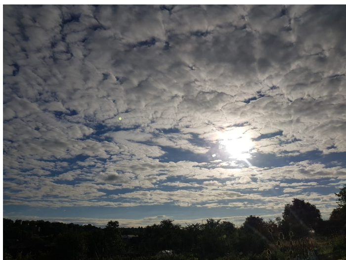
Moody sky over Sunnyside