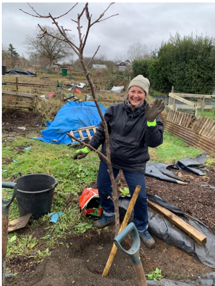
Hello from Puri ... planting new trees having just taken on her shared plot