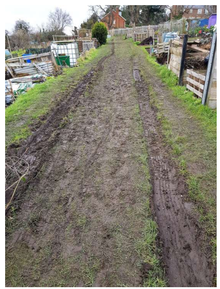
The state of A Road—Clive Smith