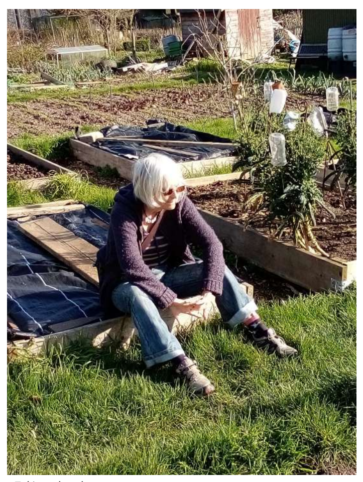
Taking a break