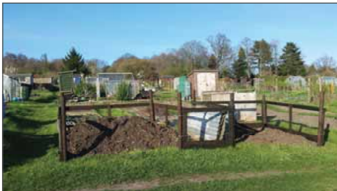
New compost heap