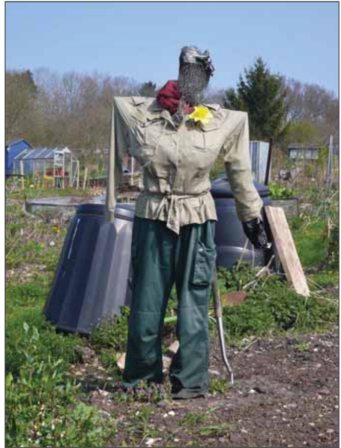
Some tenants are on their plots, whatever the weather!