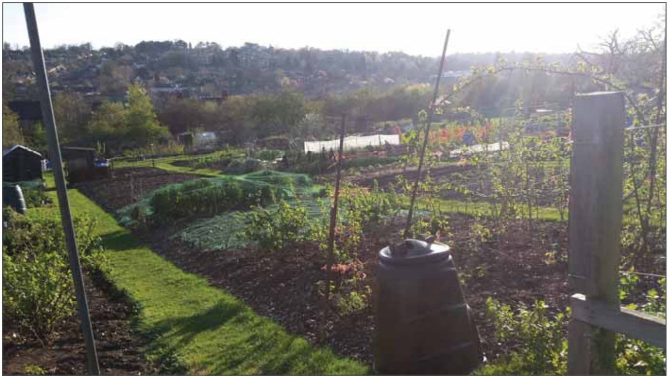
View across the valley