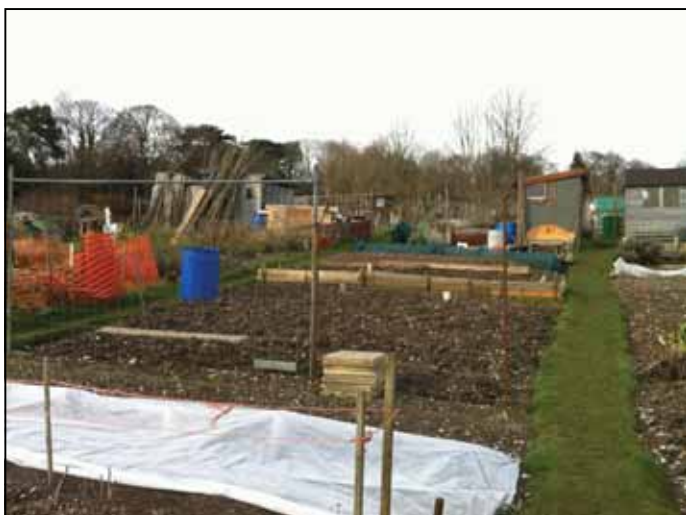
Spring planting underway