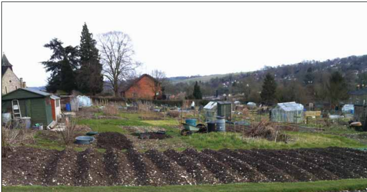
Rows and rows of potatoes!