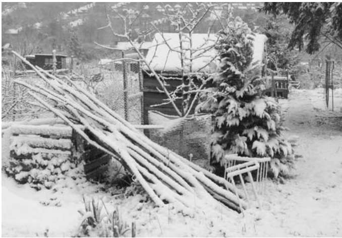
April 08 - Unexpected snow caught us all out.