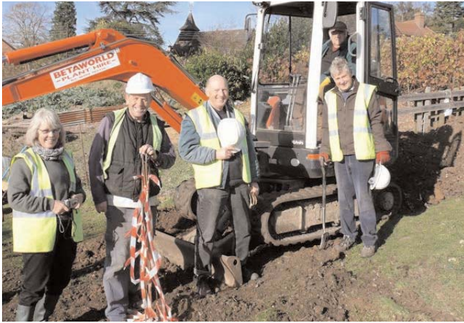
November 07 - Work on the new water infrastructure