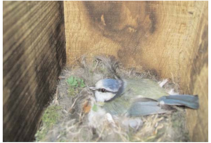
May 08 - Blue Tit in her nesting box in Birtchnells Copse