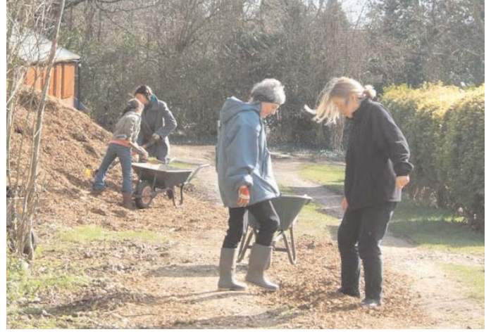
March 08 - Road repairs working party