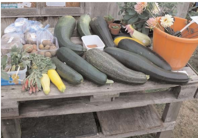
August 08 - Produce galore