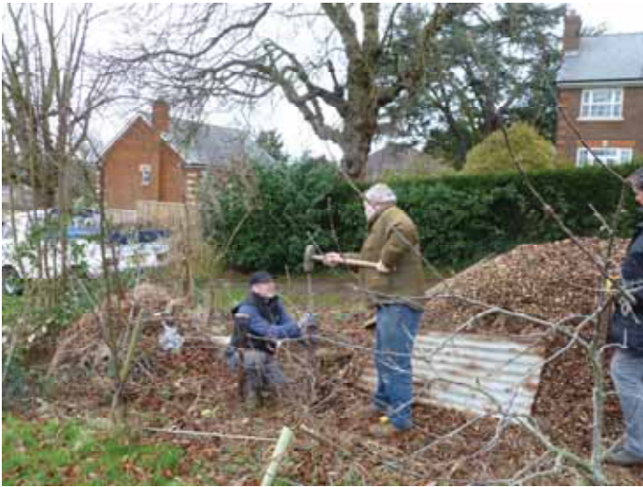
Woodchip and leaf mould containment