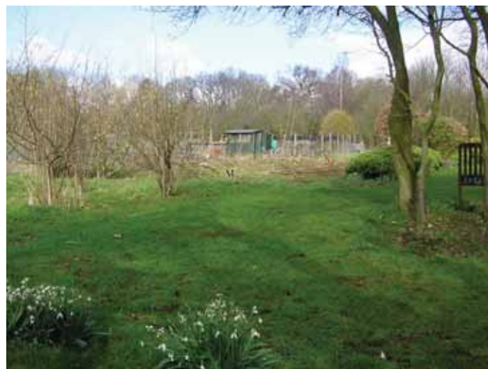
Millennium Hazel Coppice