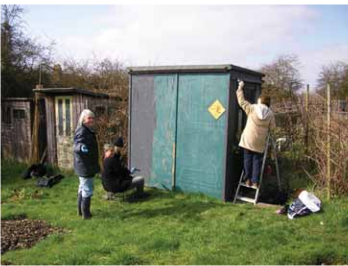
Painting the toilet