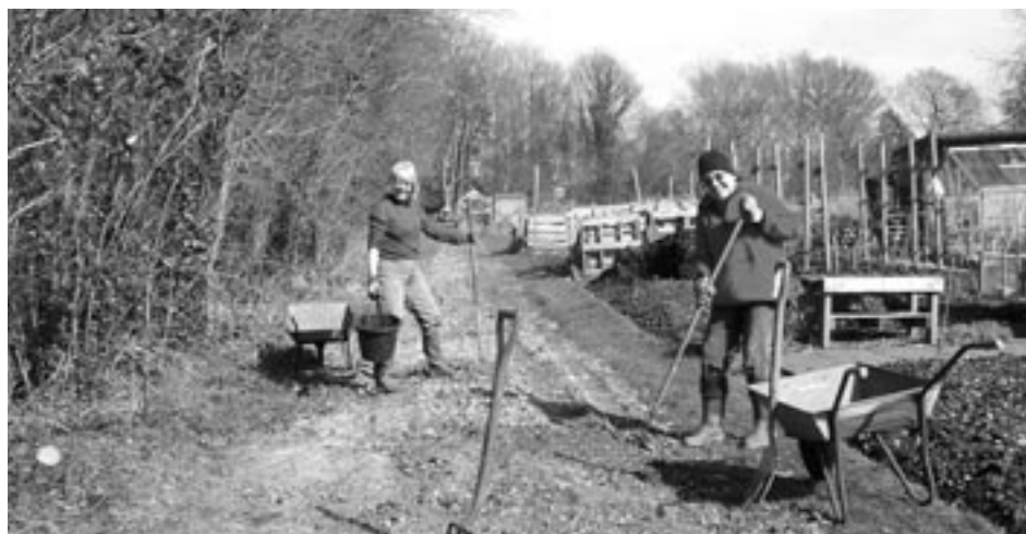
Above: The 1st March working party made a good start on repairs to the roadways.