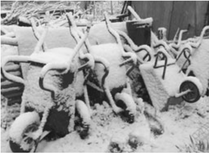
Above & below: Who would have thought these lovely pictures could have been taken on April 6th!