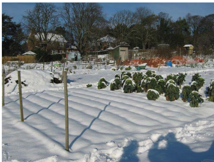
Sunnyside Old in the snow