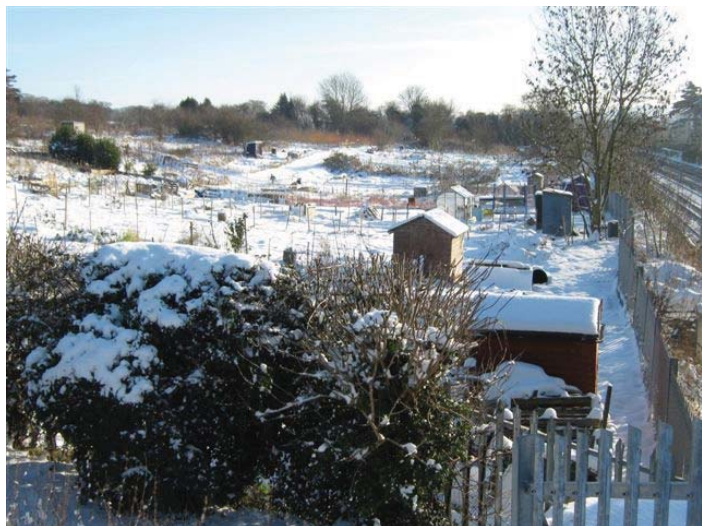
Sunnyside New in the snow