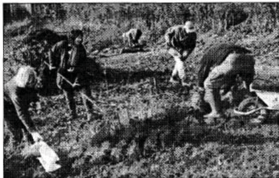
LEFT: Christmas Cheer Sunnyside style!