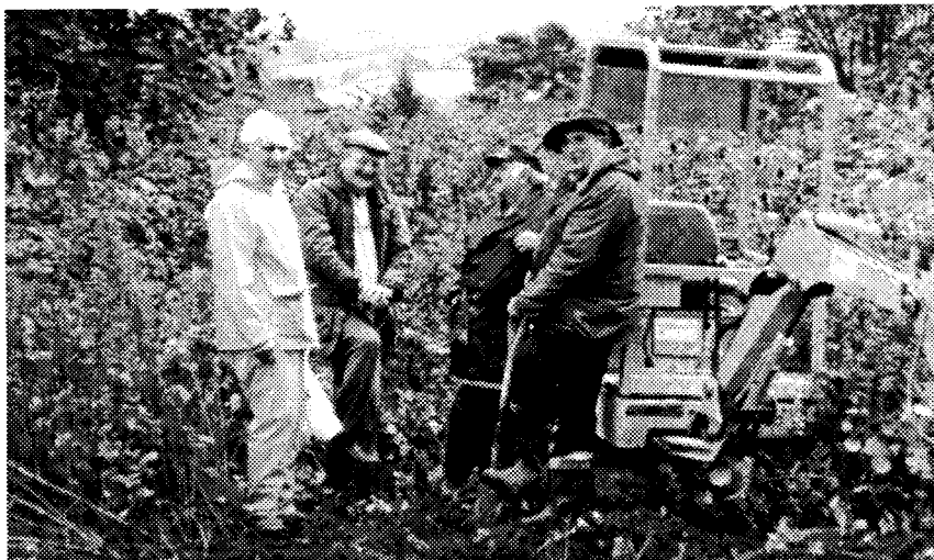
Left: A break from the hard work!

A supply of black plastic has been obtained and once the vegetation cut down has been burned we will cover the ground to minimise re-growth. Hopefully the wet weather will cease to enable the two gardens partially cleared to be finished off.